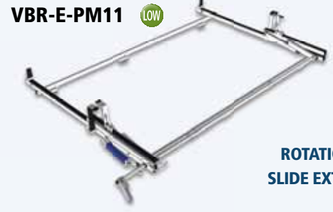
ROTATION WITH SLIDE EXTENSION