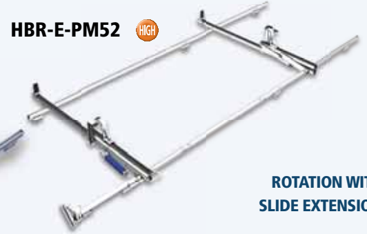
ROTATION WITH SLIDE EXTENSION